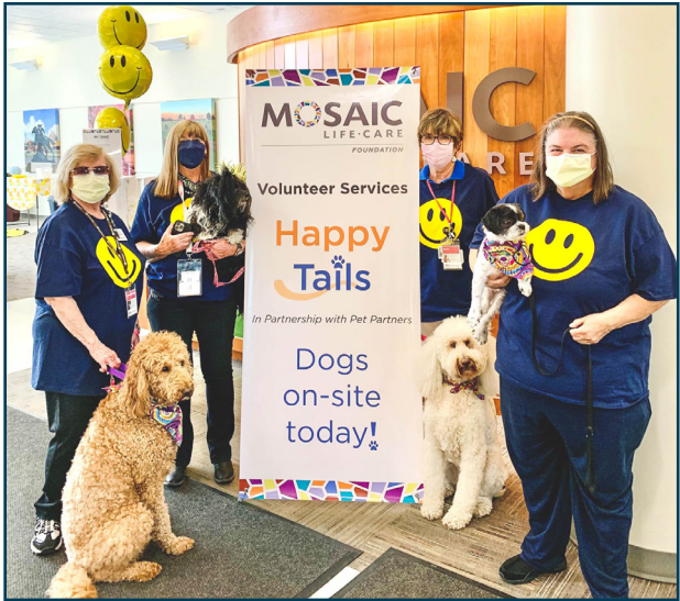
Happy Tails volunteers