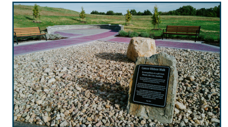
Mosaic Life Care Auxiliary Cancer Ribbon Walk