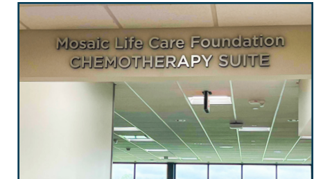
Mosaic Life Care Foundation Chemotherapy Suite