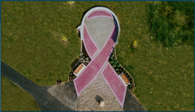
Cancer Ribbon Walk

The Auxiliary, an organization of caring volunteers, in cooperation with Mosaic, promotes community goodwill and provides support to enhance health care for our patients and their families.