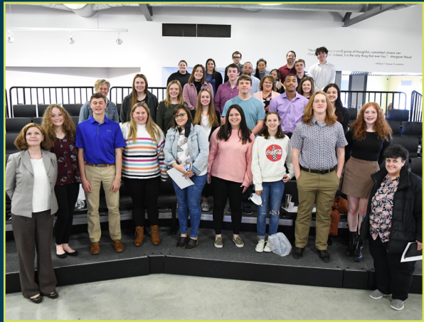
2021-22 e2 Fellowship teams