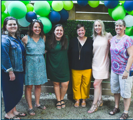
Caregivers at the Patron Party