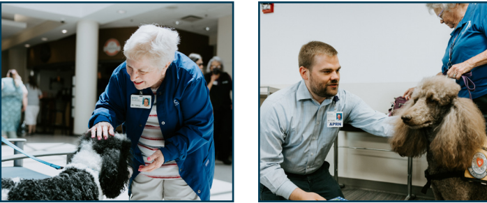
Volunteers and caregivers pet Happy Tails dogs

Since 2018, Volunteer Services has valued the partnership with Pet Partners, the leading therapy animal organization in the United States. The organization demonstrates and promotes the health and wellness benefits of animal-assisted therapy, activities and education.