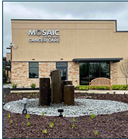
Mosaic Foundation — Albany Basalt fountain

Mosaic Foundation — Albany knows how important it is to keep care close to home and improve the health of the region. The Foundation demonstrated that commitment multiple ways this fiscal year: