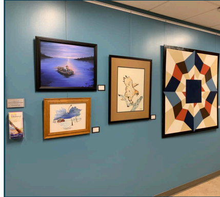
Spring installation artwork display