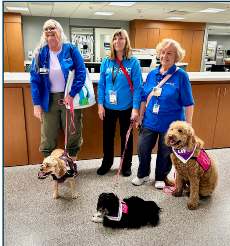
Happy Tails Program at Mosaic Life Care - St. Joseph