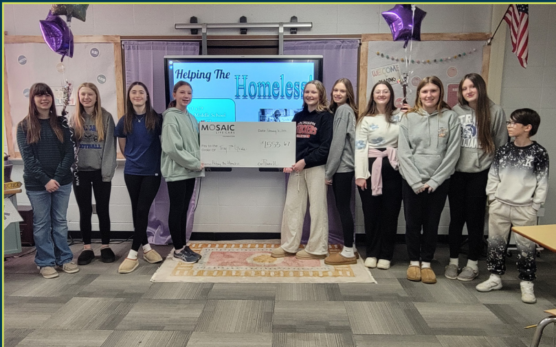
Troy Middle School 6th grade students receiving Jump Starter Grant