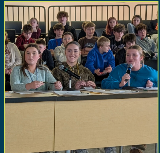
Student commissioners listening to presentation at a recent Civic Engagement Immersion