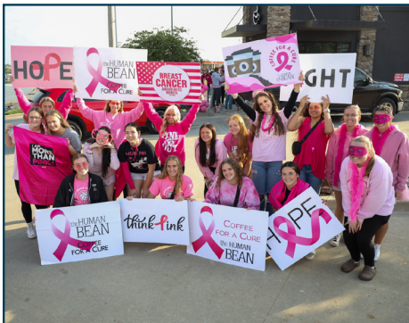
The Human Bean's Coffee for a Cure