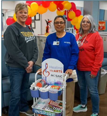
Healing HeARTS cart at Mosaic Life Care - Cancer Care