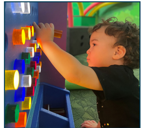
Young visitor being curious and exploring in the Infant and Toddler Space