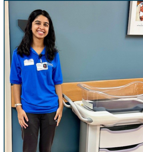
New Beginnings Program volunteer in OB Maternity at Mosaic Life Care - St. Joseph