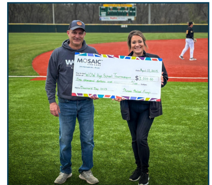
W.O.W. Baseball Tournament

The Mosaic Life Care Auxiliary, an organization of caring volunteers, in cooperation with Mosaic Life Care, promotes community goodwill and provides support to enhance health care for our patients and their families.