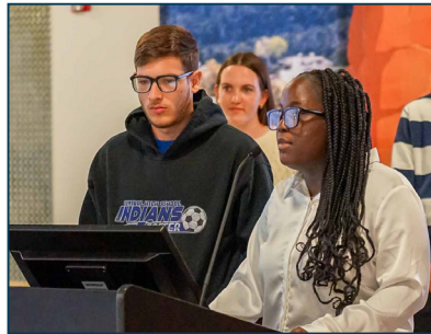
e2 participants presenting ethical dilemmas