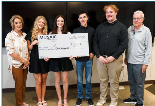
Scholarship Awards for MLC student volunteers