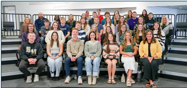
e2 participants, 2024-25

The teams are made up of two high school students and one adult sponsor. The Foundation has recognized the power of diverse and cross-generational collaboration. This leadership journey challenges influences, identifies core values and begins an expedition where youth are the creators of this region's future.