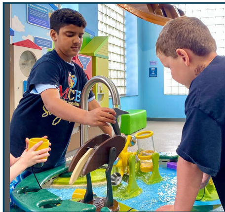
Field trip students collaborating to navigate the Missouri River at the Missouri American Water Water Table